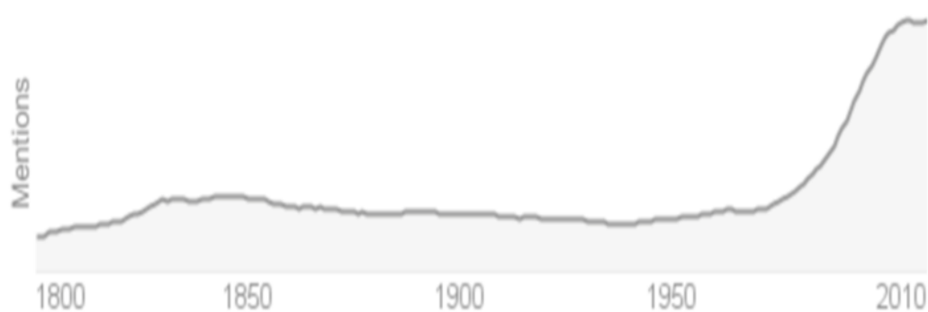
Figure 2. Spirituality