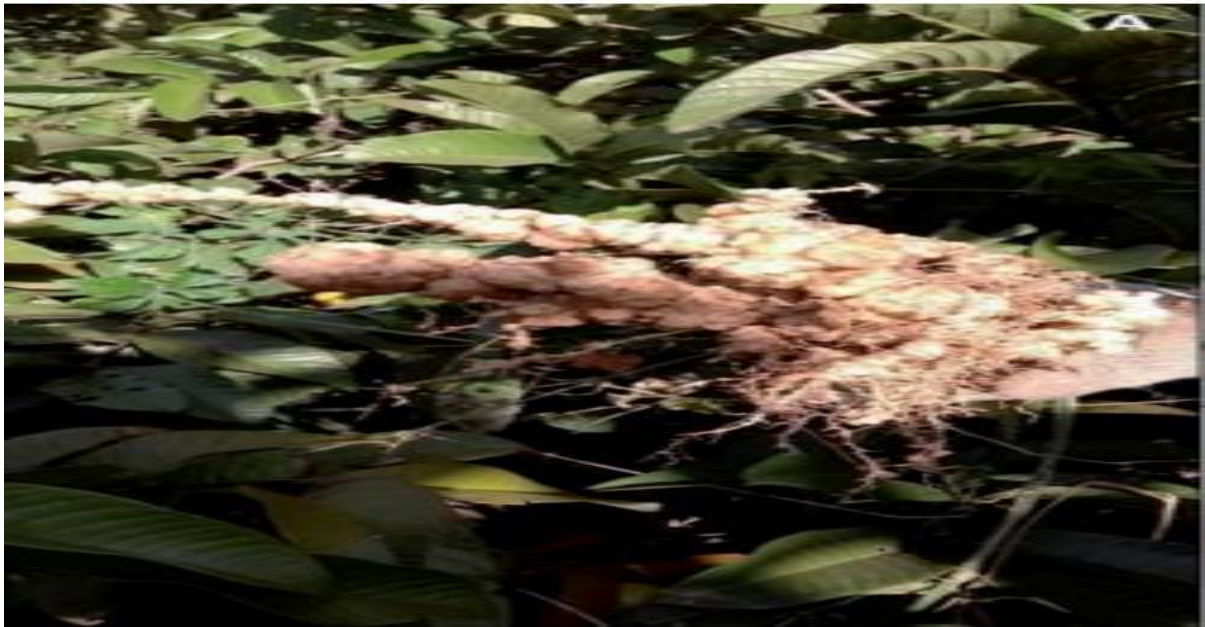
Figure 2: Accumulation of nematode in the roots of guava ( Psidium guajava var. Paluma ) [51].

Controlling these parasites with nematicides is not cost-effective because, on one hand, they are expensive, and on the other hand, due to the lack of specific symptoms and locations for these parasites, they are non-selective and toxic to humans [52, 53]. Therefore, using biological agents is a more economical and environmentally friendly way to manage nematodes [54].